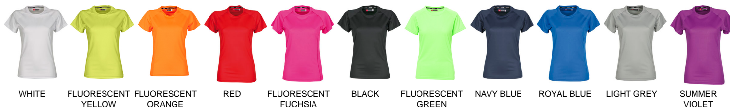
WHITE FLUORESCENT YELLOW FLUORESCENT ORANGE RED FLUORESCENT FUCHSIA BLACK FLUORESCENT GREEN NAVY BLUE ROYAL BLUE LIGHT GREY SUMMER VIOLET